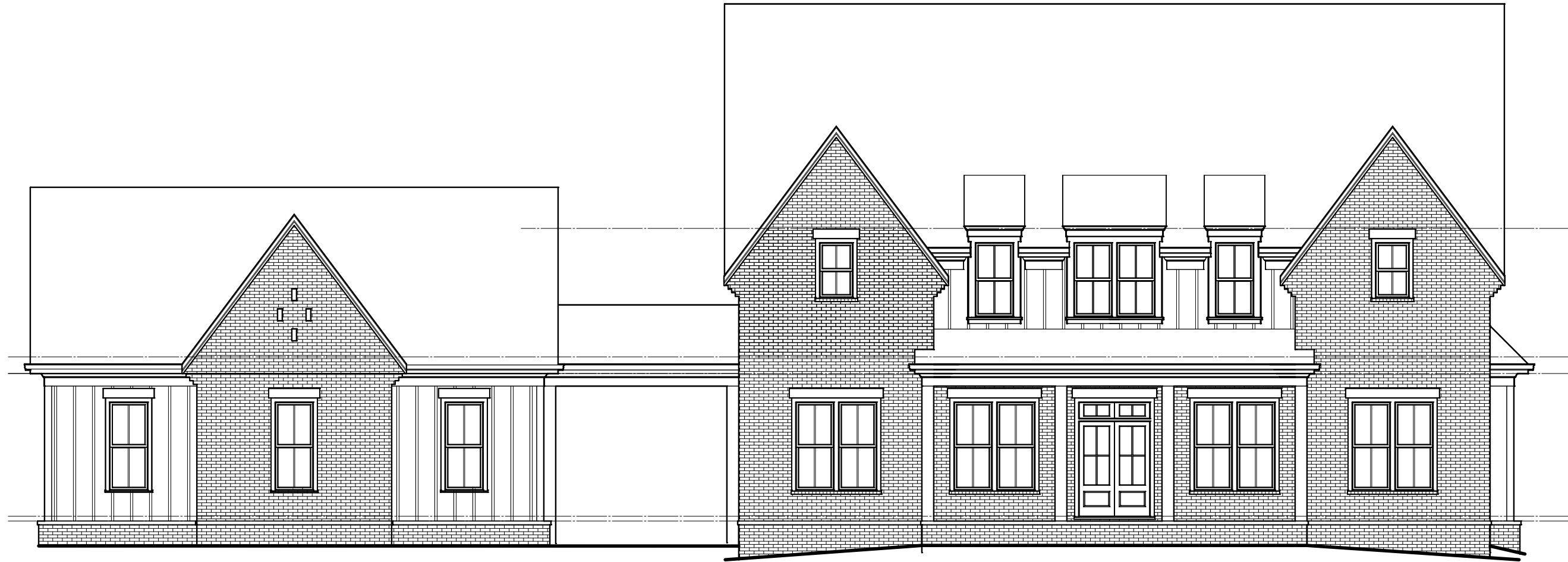
1 FRONT ELEVATION A5 SCALE: 1/8" = 1'-0"

GARCIA residential design 1701 HEIGHTS CIRCLE KENNESAW GA 30142 TEL: (678) 735-2176 WWW.GARCIADESIGN.COM